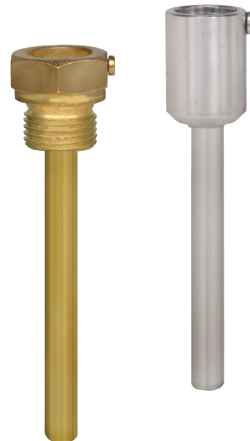
Fig. left: Thermowell with thread

Based on the almost limitless application possibilities, there are a large number of variants, such as thermowell designs or materials. The type of process connection and the basic method of manufacture are important design differentiation criteria. A basic differentiation can be made between threaded and weld-in thermowells, and those with flange connections.